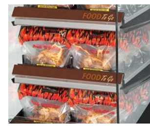
Keeps hot food at 65°C