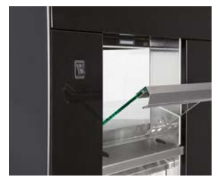
Rear doors (optional)