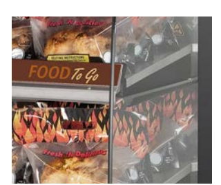
Optimum product visibility