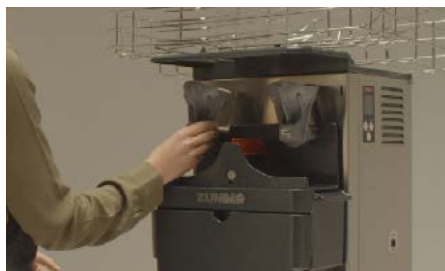
7. Fit the cups.