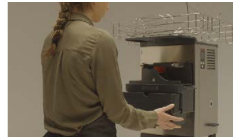
6. Fit the filter tray.