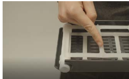
5. Place the scraper relief upwards.