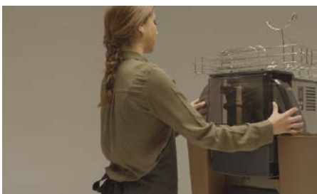
10. Fit the front cover.