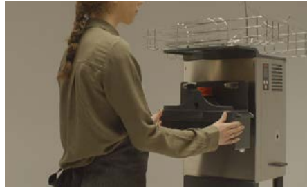
2. Mount the juice extraction system