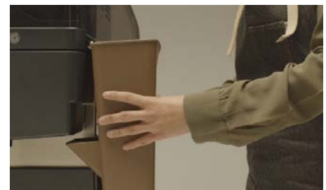
9. Each container in the correct position in the groove.