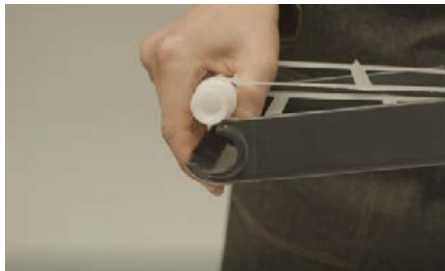
4. Fit the scraper with its shafts and insert them into the filter.