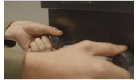
3. Screw the nuts.