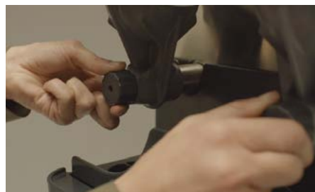
8. Firmly screw the nuts.