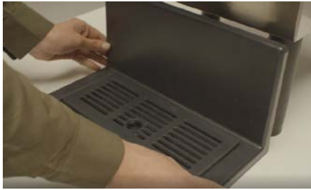
1. Fit the drip tray and grid.